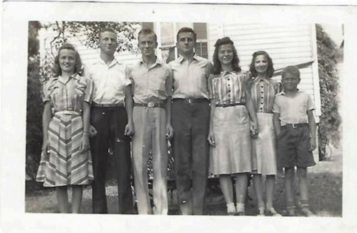
Green Family brothers and sisters